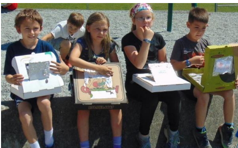
Eating Smores! (Solar Oven creation)