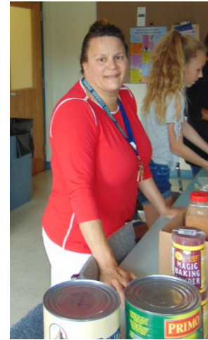
Prepping for Indian Tacos