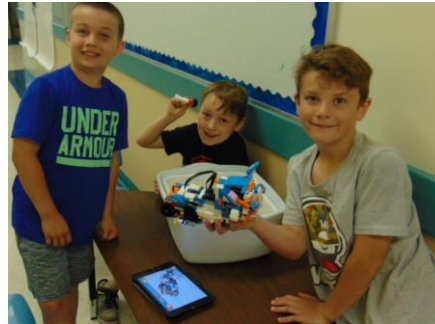
Coding with Lego Boost