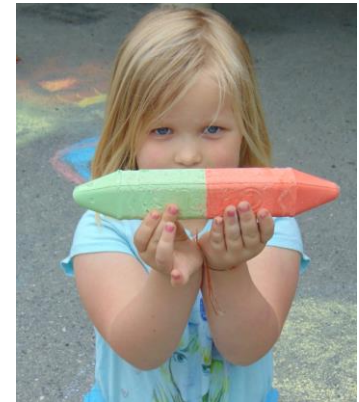
Fun Day artist at work!