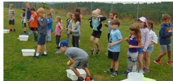
Fun Day – Water Relay