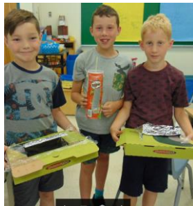
Solar Ovens ... that worked