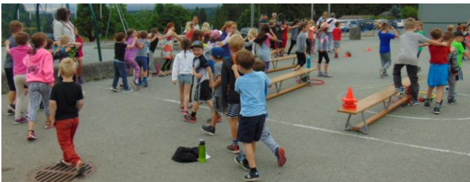
Fun Day ... the Locomotion!